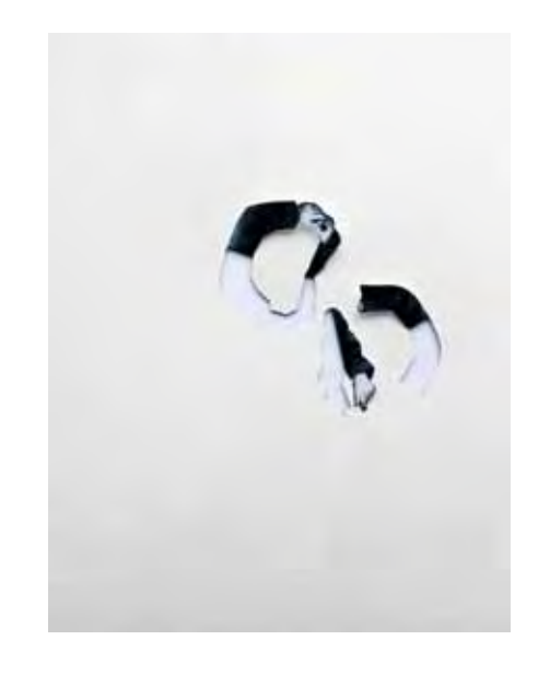
Up in Arms, 2011, series of collages